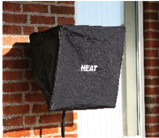
Cover for gas heater