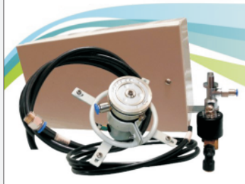
Mist head assembly